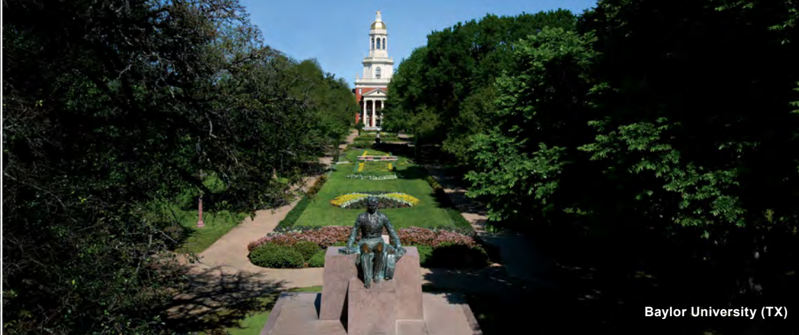
Baylor University (TX)