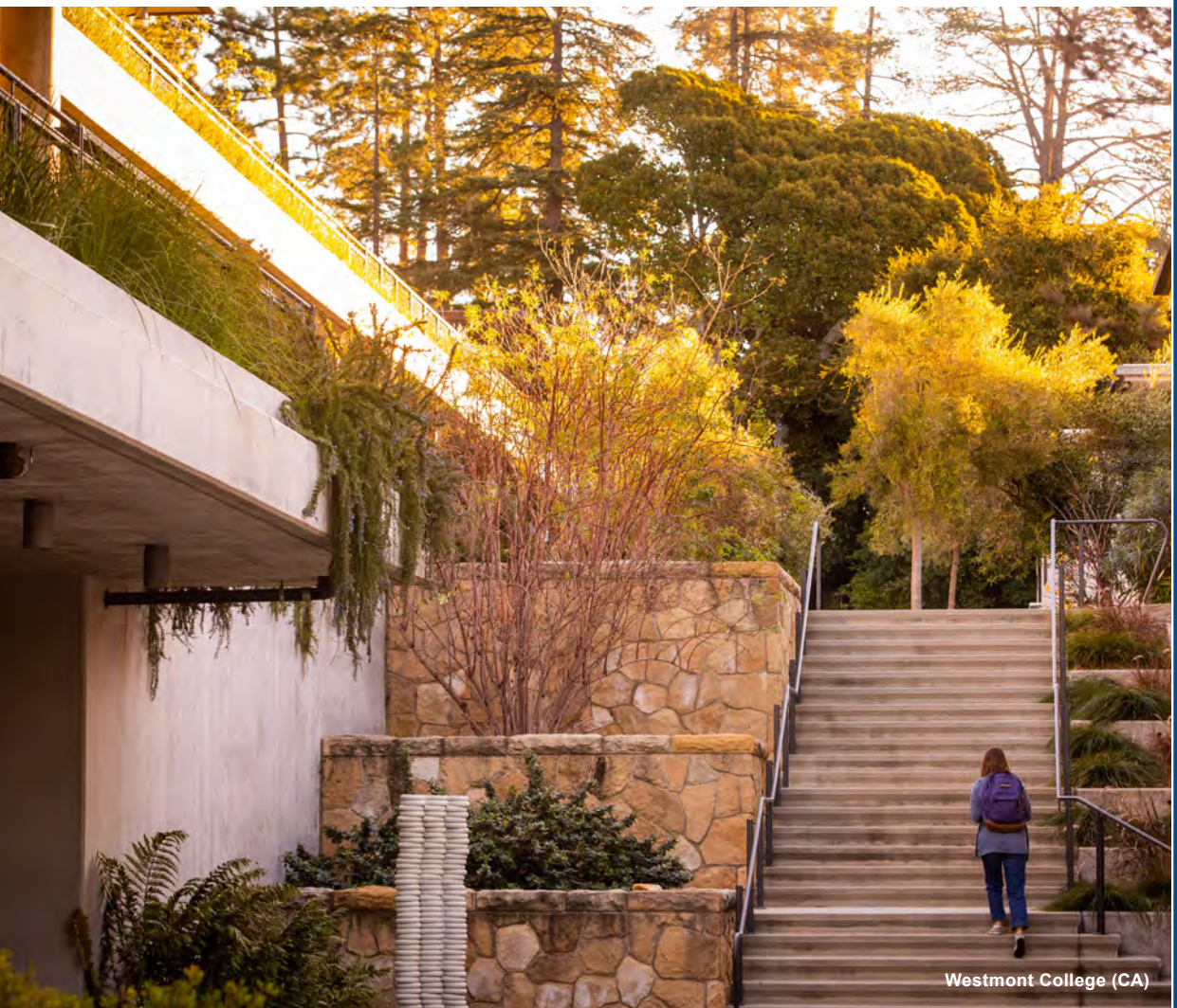
Westmont College (CA)