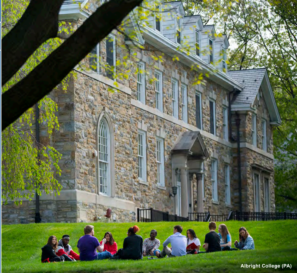
Albright College (PA)