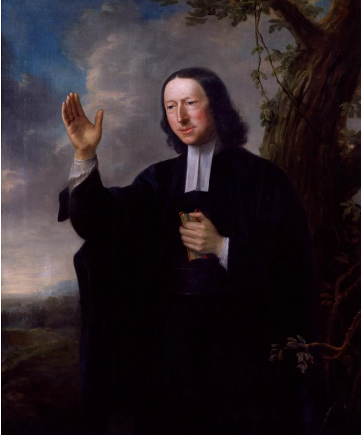
John Wesley Founder of the Methodist Movement